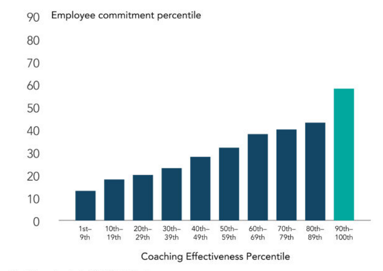
Fig. 1 – Coaching Effectiveness vs. Employee Commitment

Results based on study of 2,240 global leaders